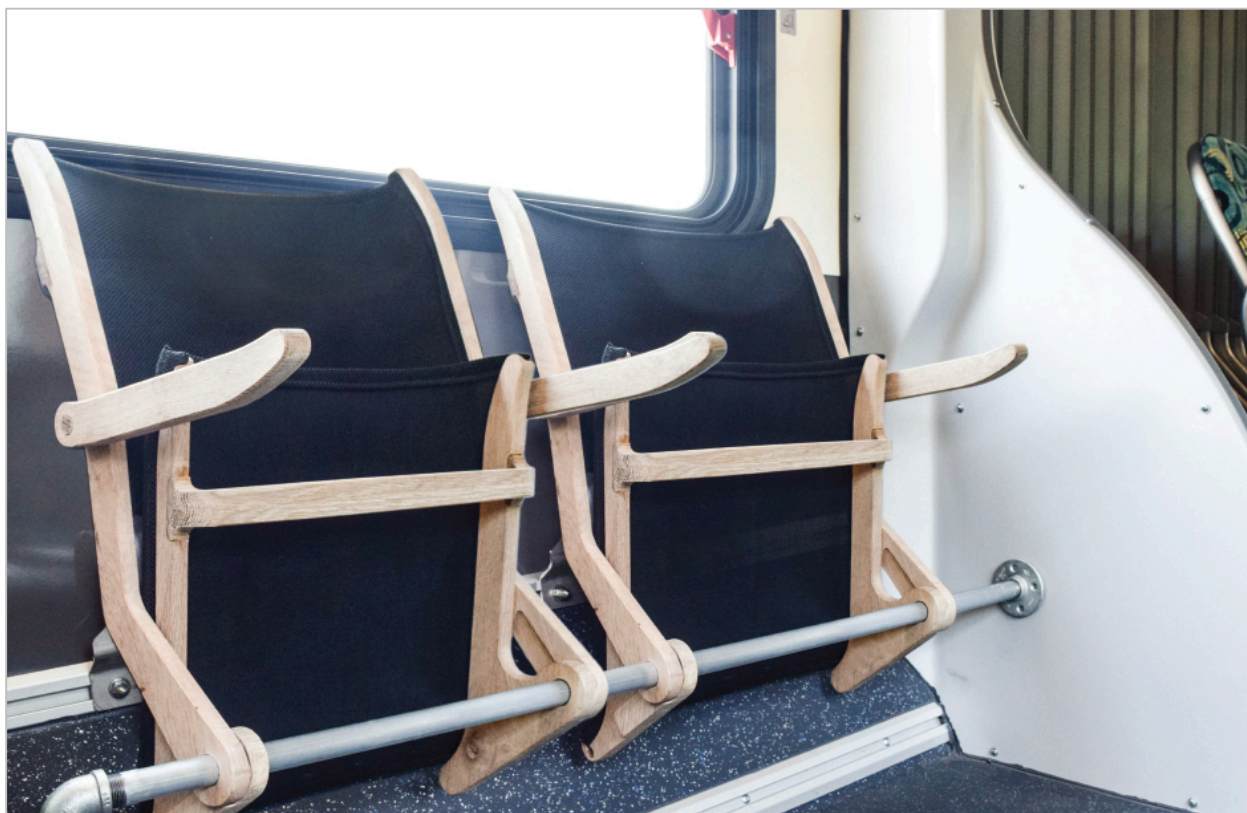
FIGURE 4 Fold-up bus seat with secure wall bracket.