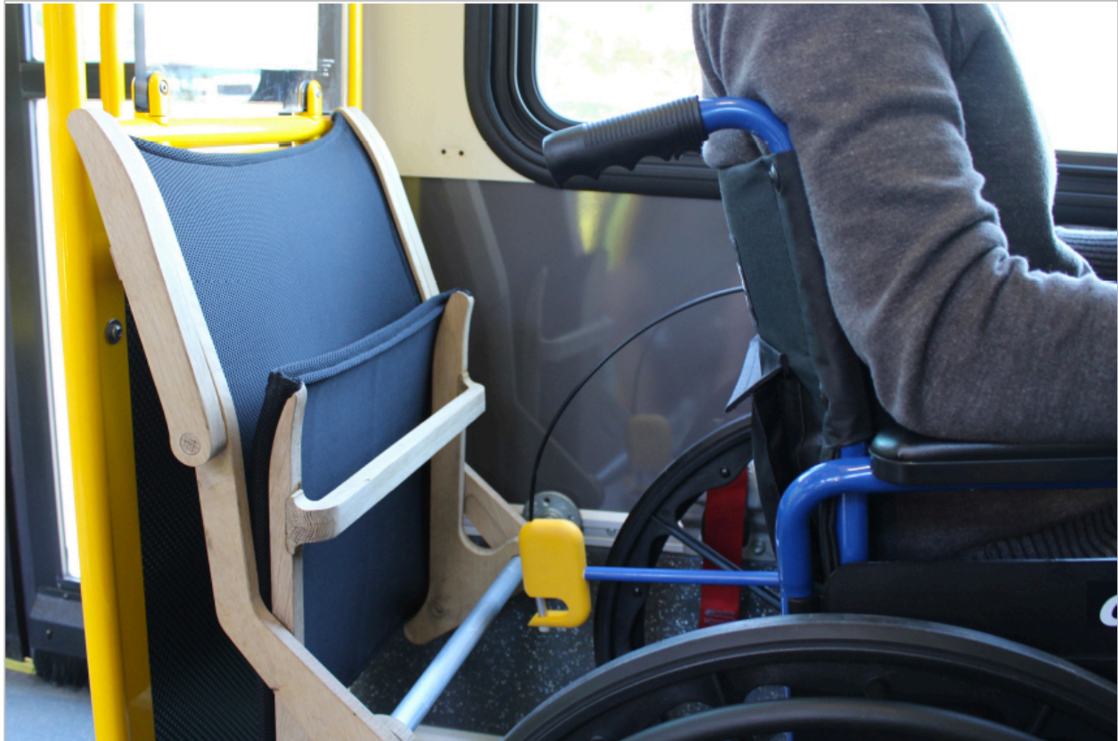
FIGURE 5 WhMD latch to wall bracket for fold-up bus seat.

Folding priority seats could be “smart” programmed to lock in the closed position until a senior citizen rider enters the bus. The senior citizen bus pass could have an RFID tag that would wirelessly communicate with the seat, similar to a security tag and detector system at a department store. A reserved seating system affords an older rider some of the convenience they lost when they stopped using their own car. Such a system could be optimized to take into account ridership patterns, and would know when older riders need more seating reserved. While this system could be controlled by software, the bus driver could also have an override if needed. This coordinated system ensures that a seat is already flipped up, out of the way, when a WhMD user enters the bus and comes to clip into the seat bar.