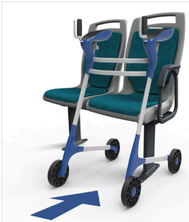
FIGURE 3 Walker designed to integrate with bus seating.

Designing walkers that can comfortably traverse the variety of terrains an elderly person would encounter from their doorstep to a bus seat has great potential. If walkers also took into account bus seat design and the interior architecture of the bus, they could provide user stability and minimize aisle obstruction to create a safer and more efficient use of the priority seating space. In addition, if the interior of the bus were re-designed in concert with the walker, the walker-user would have a more harmonious bus-riding experience. (Figure 3)