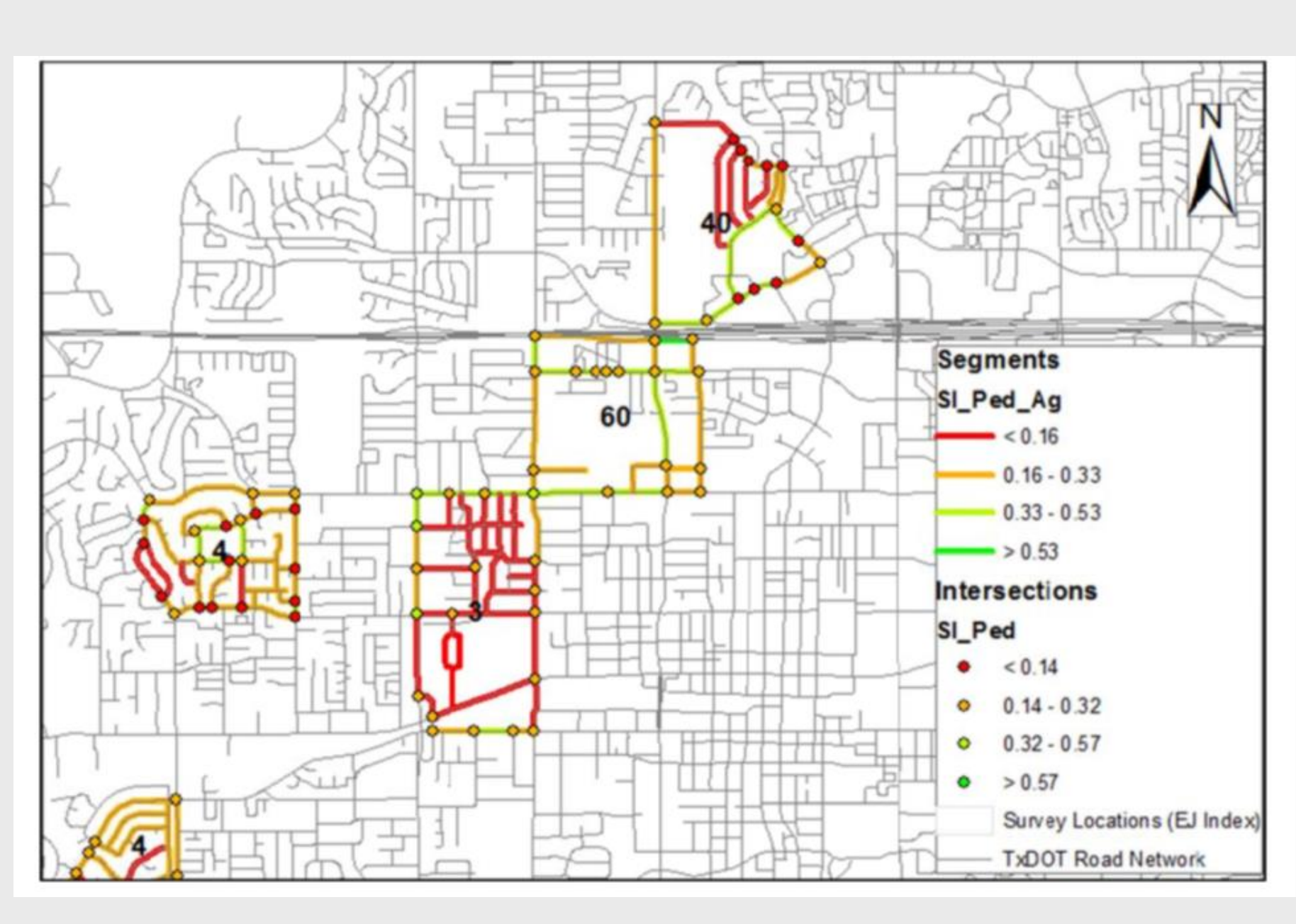
Pedestrian safety Index at selected segments and intersections (EJ≤10 & EJ>10)